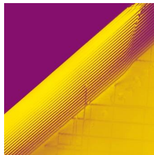
AMMRF, University of Sydney